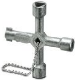
Control cabinet key, metal, for all common types of control cabinet

Please be informed that the data shown in this PDF Document is generated from our Online Catalog. Please find the complete data in the user's documentation. Our General Terms of Use for Downloads are valid ( http://phoenixcontact.com/download )