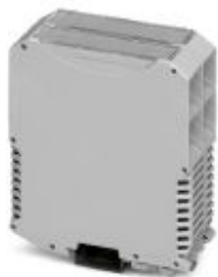
DIN rail housing, Complete housing with metal foot catch, tall design, with vents, width: 45 mm, height: 99 mm, depth: 114.5 mm, color: light gray (7035)

Please be informed that the data shown in this PDF Document is generated from our Online Catalog. Please find the complete data in the user's documentation. Our General Terms of Use for Downloads are valid ( http://phoenixcontact.com/download )