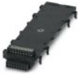
DIN rail connector, color: jet black, Number of positions per row: 16, pitch: 2.54 mm

DIN rail bus connectors - HBUS 107,6-16P-1S BK - 2896306