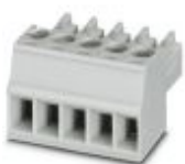
PCB connector, nominal cross section: 1.5 mm 2 , color: light gray, nominal current: 8 A, rated voltage (III/2): 160 V, contact surface: Tin, type of contact: Female connector, Number of potentials: 5, Number of rows: 1, Number of positions per row: 5, number of connections: 5, product range: MC 1,5/...-ST, pitch: 3.5 mm, connection method: Screw connection with tension sleeve, conductor/PCB connection direction: 0 °, Stecksystem: MINI COMBICON, Locking: without, type of packaging: packed in cardboard

Printed-circuit board connector - MC 1,5/ 5-ST-3,5 GY7035 - 1769087