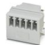
PCB headers, nominal cross section: 1.5 mm 2 , color: light gray, nominal current: 8 A, rated voltage (III/2): 160 V, contact surface: Tin, type of contact: Male connector, Number of rows: 1, Number of positions per row: 5, product range: MCO 1,5/...-G1, pitch: 3.5 mm, mounting: Soldering, pin layout: Linear pinning, solder pin [P]: 2 mm, Locking: without, Article with lateral pin exit

Feed-through header - MCO 1,5/ 5-G1R-3,5 KMGY - 2278351