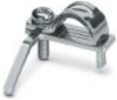
Shield connection clamp for printed circuit terminal block

Shield connection clamp - ME-SAS - 2853899