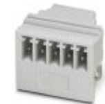
PCB headers, nominal cross section: 1.5 mm 2 , color: light gray, nominal current: 8 A, rated voltage (III/2): 160 V, contact surface: Tin, type of contact: Male connector, Number of rows: 1, Number of positions per row: 5, product range: MCO 1,5/...-G1, pitch: 3.5 mm, mounting: Soldering, pin layout: Linear pinning, solder pin [P]: 2 mm, Locking: without, Article with lateral pin exit

Feed-through header - MCO 1,5/ 5-G1L-3,5 KMGY - 2278380