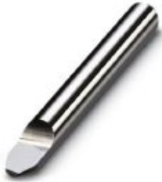
Fully hard metal chisel, 1 cutting edge, cutting width: 0.3 mm

Please be informed that the data shown in this PDF Document is generated from our Online Catalog. Please find the complete data in the user's documentation. Our General Terms of Use for Downloads are valid ( http://phoenixcontact.com/download )