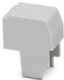
DIN rail housing, Filler plug for unoccupied terminal points, color: light gray (7035)

Please be informed that the data shown in this PDF Document is generated from our Online Catalog. Please find the complete data in the user's documentation. Our General Terms of Use for Downloads are valid ( http://phoenixcontact.com/download )