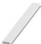
Zack Marker strip, flat, can be ordered: Strip, white, labeled according to customer specifications, mounting type: snap into flat marker groove, for terminal block width: 5 mm, lettering field size: 5.15 x 5.15 mm, Number of individual labels: 10

Zack Marker strip, flat - ZBF 5 CUS - 0825025