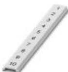
Zack Marker strip, flat, Strip, white, labeled, Printed vertically: consecutive numbers 1 ... 10, 11 ... 20, etc. up to 91 ... 100, mounting type: snap into flat marker groove, for terminal block width: 5 mm, lettering field size: 5.15 x 5.15 mm, Number of individual labels: 10

Zack Marker strip, flat - ZBF 5,QR:FORTL.ZAHLEN - 0808697