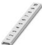
Zack Marker strip, flat, Strip, white, labeled, printed horizontally: consecutive numbers 1 ... 10, 11 ... 20, etc. up to 491 ... 500, mounting type: snap into flat marker groove, for terminal block width: 5 mm, lettering field size: 5.15 x 5.15 mm, Number of individual labels: 10

Zack Marker strip, flat - ZBF 5,LGS:FORTL.ZAHLEN - 0808671