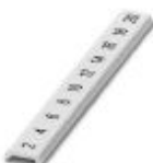
Zack Marker strip, flat, Strip, white, labeled, printed horizontally: consecutive numbers 2 ... 20, 22 ... 40, etc. up to 82 ... 100, mounting type: snap into flat marker groove, for terminal block width: 5 mm, lettering field size: 5.15 x 5.15 mm, Number of individual labels: 10

Zack Marker strip, flat - ZBF 5,LGS:GERADE ZAHLEN - 0810821