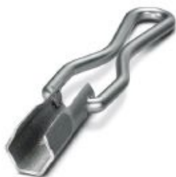
Allen wrench, for loosening and fastening the QUICKON union nut, WAF 22 mm

Please be informed that the data shown in this PDF Document is generated from our Online Catalog. Please find the complete data in the user's documentation. Our General Terms of Use for Downloads are valid ( http://phoenixcontact.com/download )