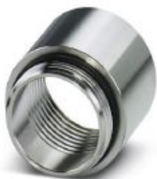
NPT adapter, IP68, up to 5 bar, incl. O-ring seal, M32 to 1"

Please be informed that the data shown in this PDF Document is generated from our Online Catalog. Please find the complete data in the user's documentation. Our General Terms of Use for Downloads are valid ( http://phoenixcontact.com/download )