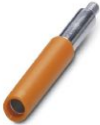
Female test connector, color: orange

Please be informed that the data shown in this PDF Document is generated from our Online Catalog. Please find the complete data in the user's documentation. Our General Terms of Use for Downloads are valid ( http://phoenixcontact.com/download )